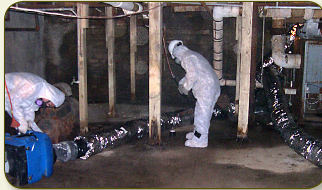
Workers remove mold and asbestos from the basement under the stage.